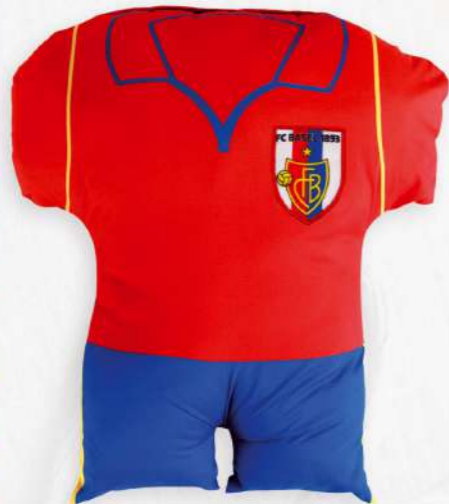
JERSEY KIT PILLOW 26-4401