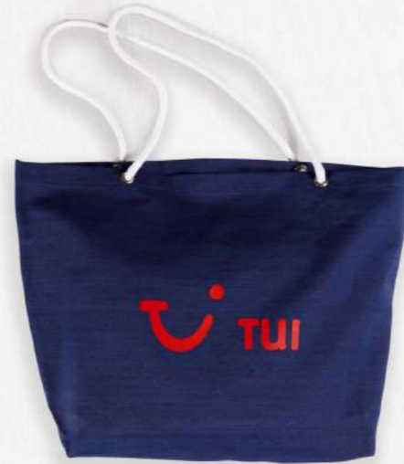
BEACH BAG 26-0701