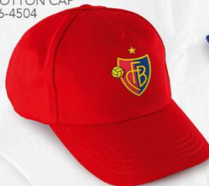
COTTON CAP 26-4504