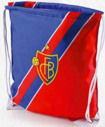
SPORTS BACKPACK 26-4601