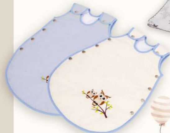
SLEEVELESS BABY SLEEPING BAG 26-1503