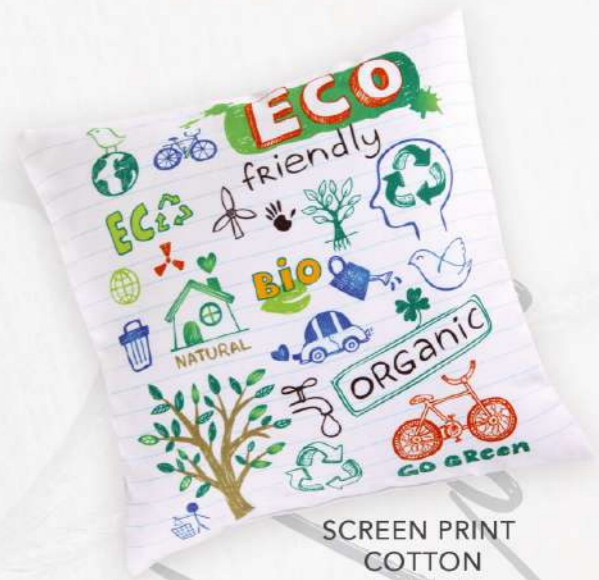
SCREEN PRINT COTTON 26-2902