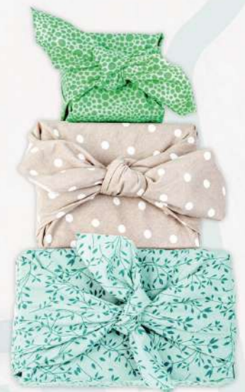
FABRIC GIFT WRAP 26-0906