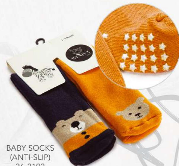
BABY SOCKS (ANTI-SLIP) 26-2102