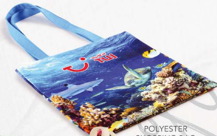
POLYESTER SHOPPING BAG 26-2302