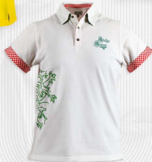
POLO T-SHIRT 26-1103