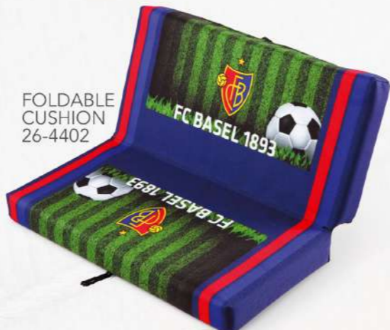
FOLDABLE CUSHION 26-4402