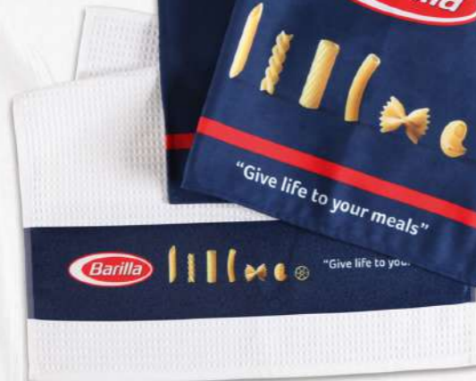
KITCHEN TOWEL 26-3006