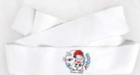
HEAD TIE 26-4008