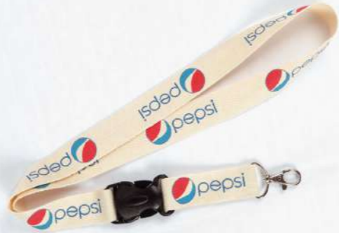
LETTERFLEX PRINTED COTTON 26-3402