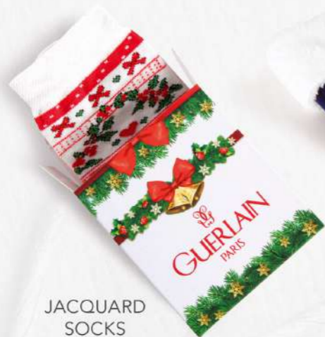
JACQUARD SOCKS 26-2001