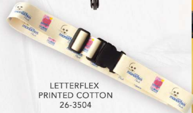
LETTERFLEX PRINTED COTTON 26-3504