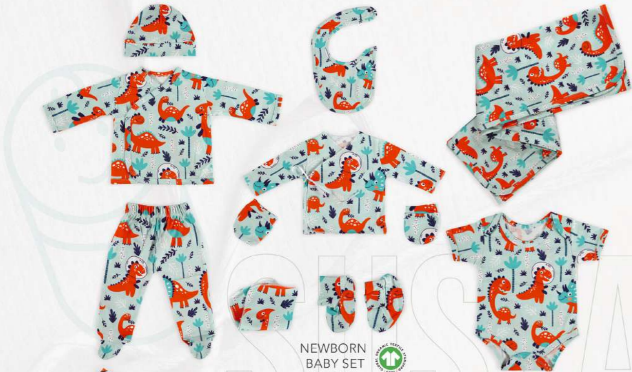
NEWBORN BABY SET 26-0601