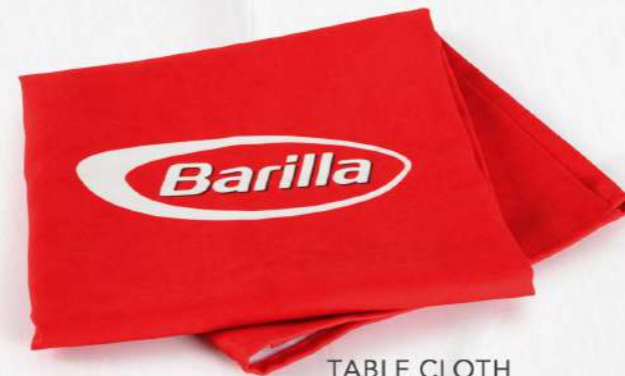
TABLE CLOTH 26-3101