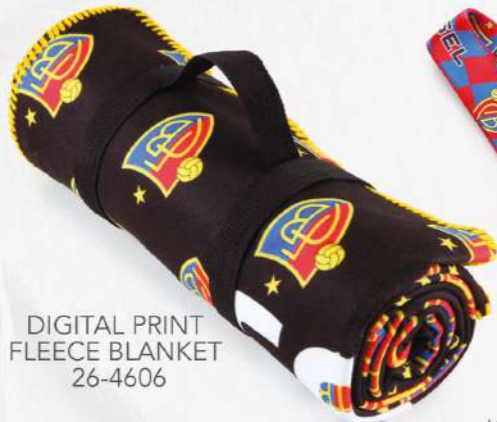
DIGITAL PRINT FLEECE BLANKET 26-4606