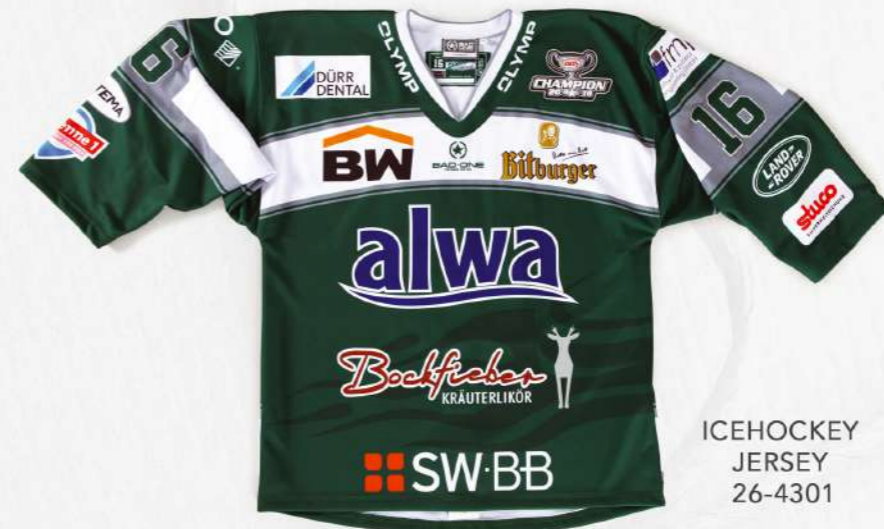
ICEHOCKEY JERSEY 26-4301