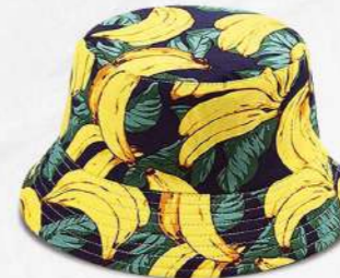
DIGITAL PRINT BUCKET HAT 26-1904