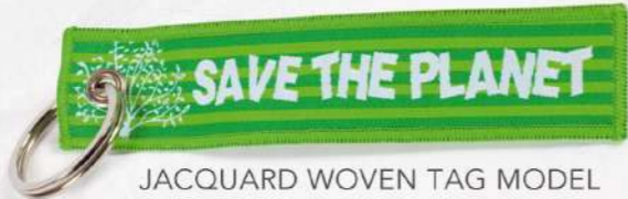
JACQUARD WOVEN TAG MODEL 26-3603