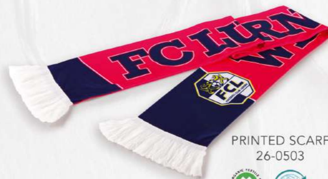
PRINTED SCARF 26-0503