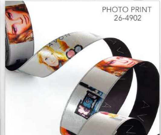
PHOTO PRINT 26-4902