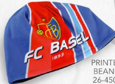
PRINTED BEANIE 26-4502