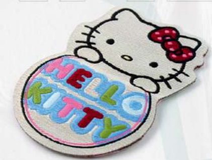
WOVEN BADGE 26-0904