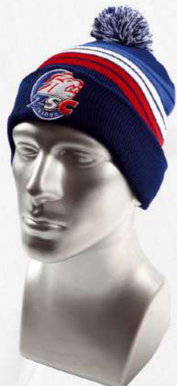
KNITTED BEANIE WITH EMBROIDERY 26-1801