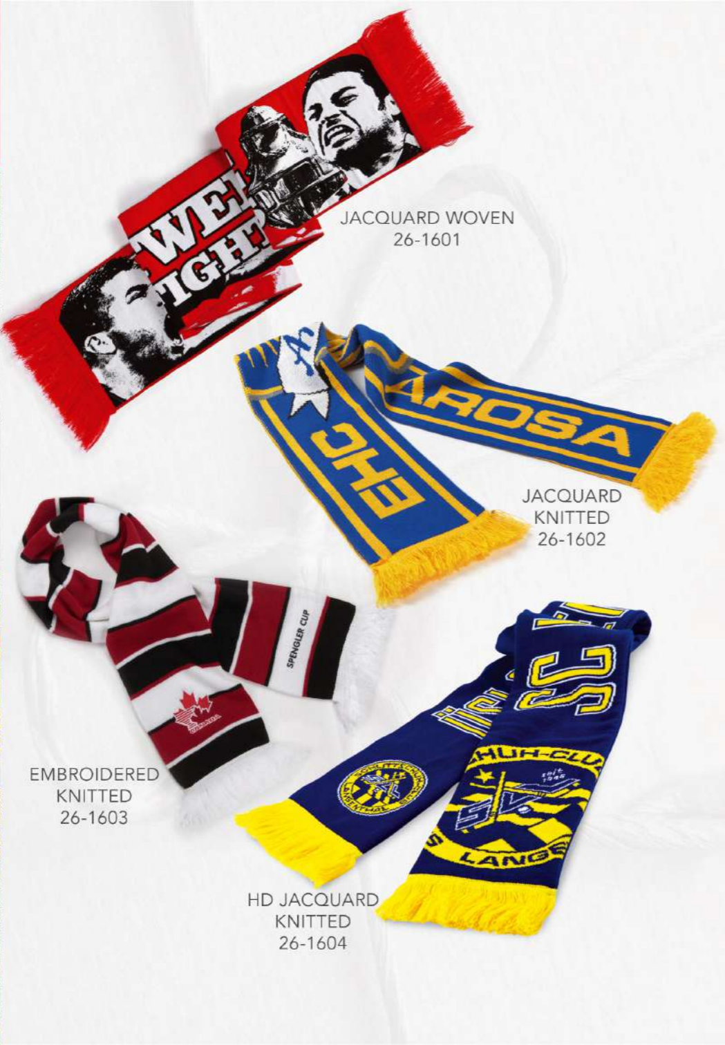
JACQUARD WOVEN 26-1601