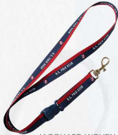
JACQUARD WOVEN 26-3401