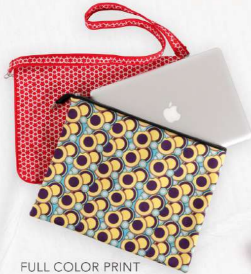
FULL COLOR PRINT LAPTOP CASE 26-3801