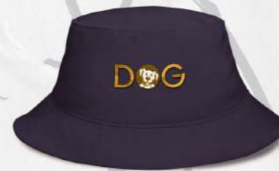
EMBROIDERED BUCKET HAT 26-1905