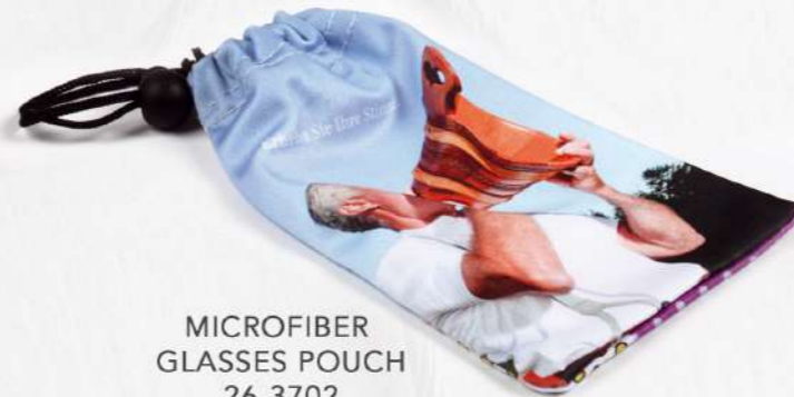
MICROFIBER GLASSES POUCH 26-3702