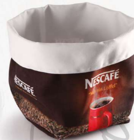
BREAD BASKET 26-3102