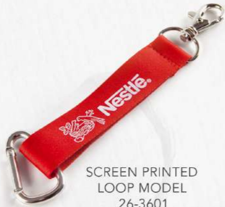
SCREEN PRINTED LOOP MODEL 26-3601