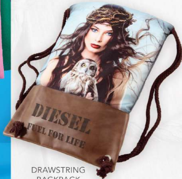
DRAWSTRING BACKPACK 26-2203