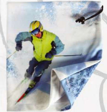
POLAR FLEECE WITH ADJUSTER STOPPER 26-3303