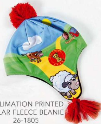
SUBLIMATION PRINTED POLAR FLEECE BEANIE 26-1805