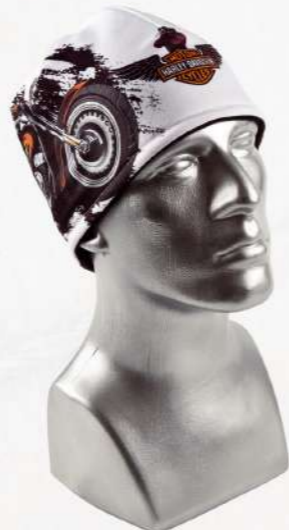
SUBLIMATION PRINTED POLAR FLEECE BEANIE 26-1803