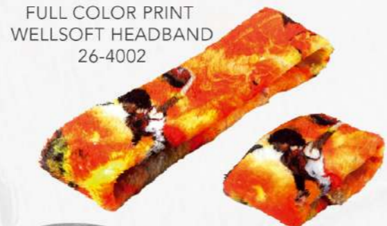
FULL COLOR PRINT WELLSOFT HEADBAND 26-4002