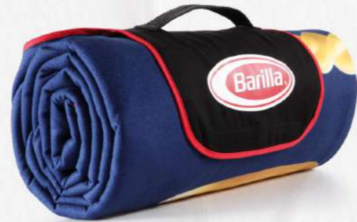
FULL COLOR PRINT PICNIC BLANKET 26-2501