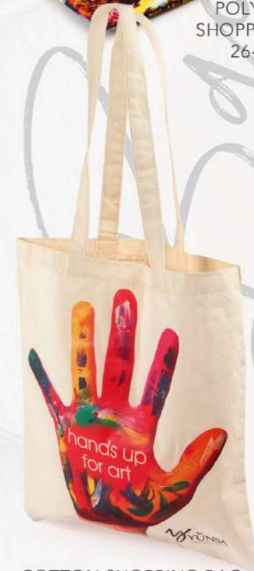
COTTON SHOPPING BAG 26-2304