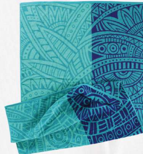
TERRY & VELOUR TOWEL 26-2701