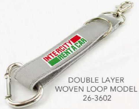
DOUBLE LAYER WOVEN LOOP MODEL 26-3602