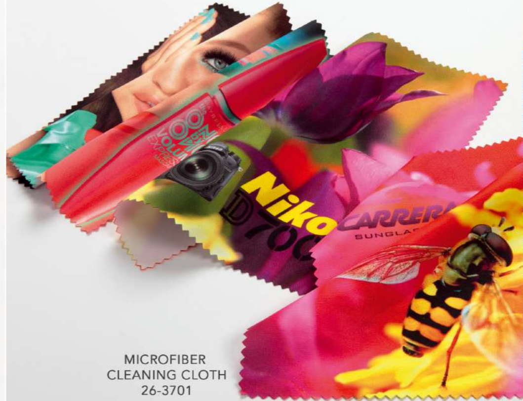
MICROFIBER CLEANING CLOTH 26-3701