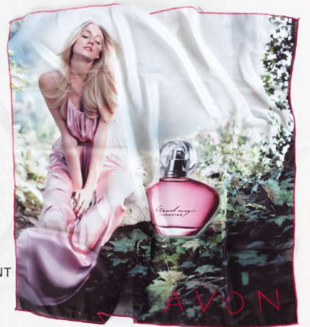
PHOTO PRINT CHIFFON 26-3302