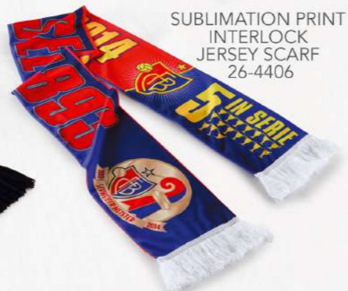
SUBLIMATION PRINT INTERLOCK JERSEY SCARF 26-4406