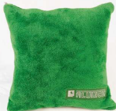
EMBROIDERED RASHEL 26-2804