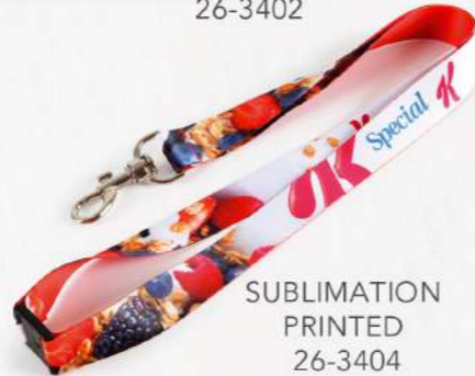
SUBLIMATION PRINTED 26-3404