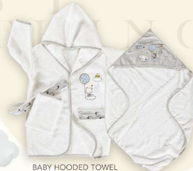
BABY HOODED TOWEL 26-1502