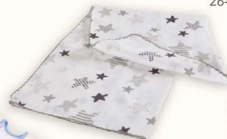
MUSLIN WRAP 26-1504