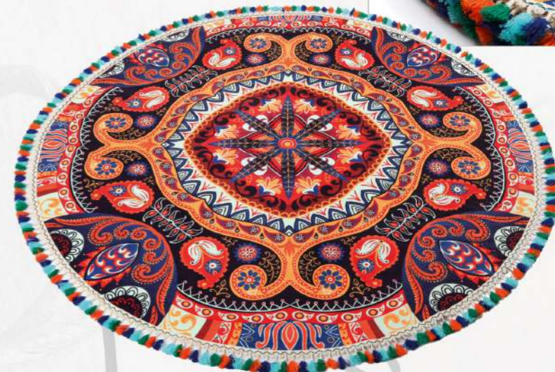
DIGITAL PRINT ROUND BEACH TOWEL 26-2702