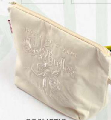
COSMETIC CASE 26-0704