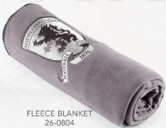
FLEECE BLANKET 26-0804