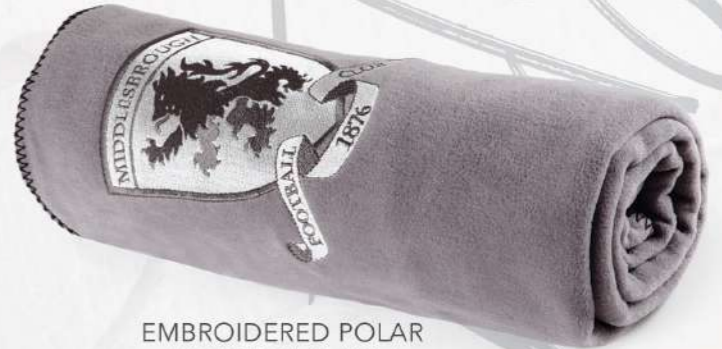
EMBROIDERED POLAR FLEECE BLANKET 26-2502