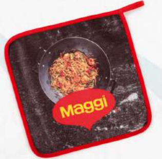
POT HOLDER 26-0903