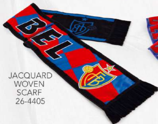
JACQUARD WOVEN SCARF 26-4405