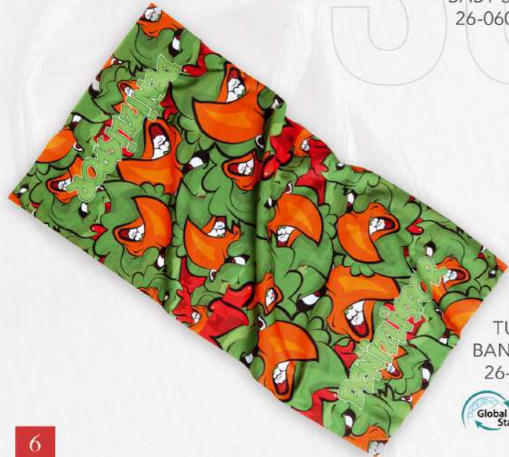
TUBE BANDANA 26-0602