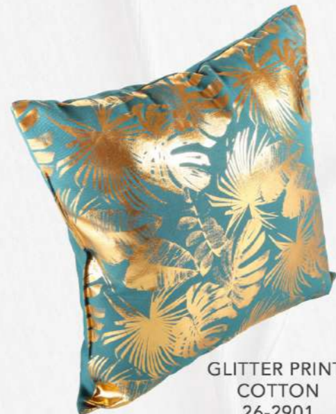
GLITTER PRINT COTTON 26-2901