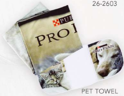
PET TOWEL DIGITAL PRINT 26-2605