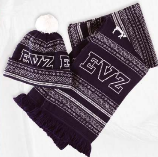
KNITTED ACRYLIC SCARF&BEANIE SET 26-1804