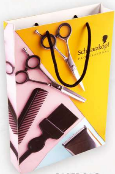
PAPER BAG 26-2202