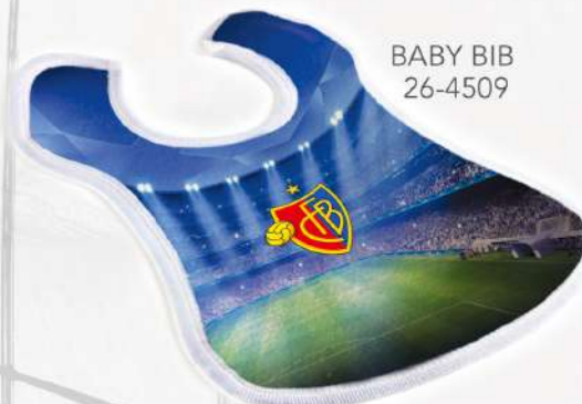
BABY BIB 26-4509