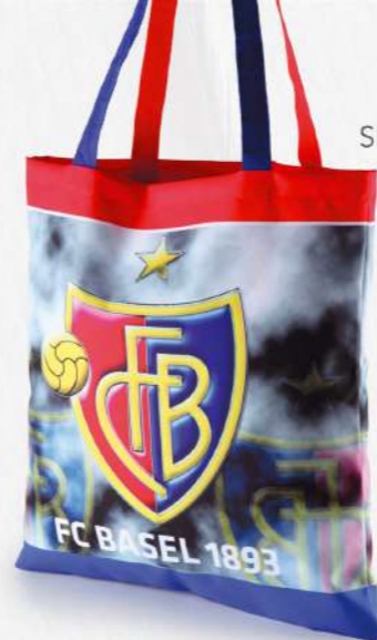
SHOPPING BAG 26-4501