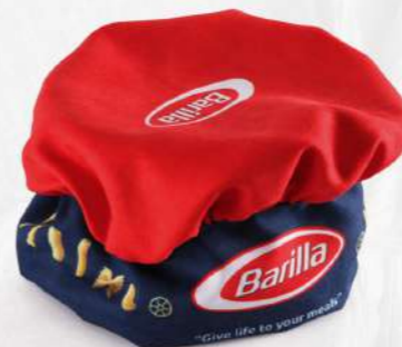
COOK HAT 26-3103