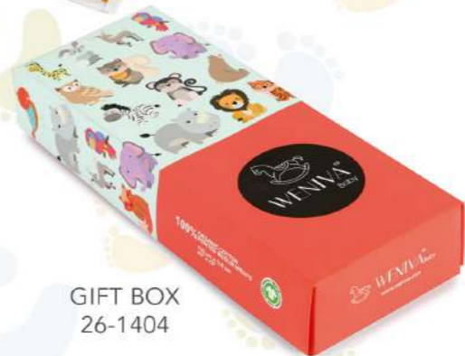
GIFT BOX 26-1404