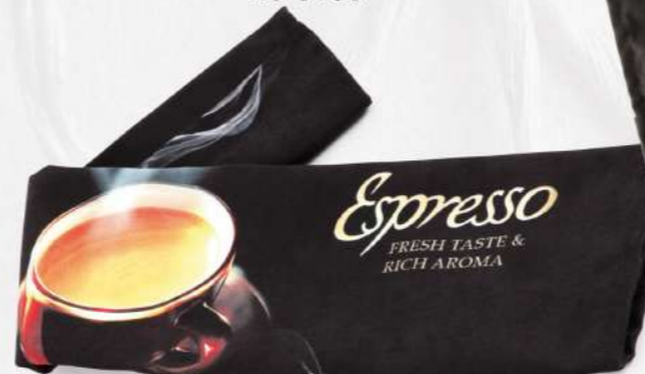
BISTRO NAPKIN 26-3104