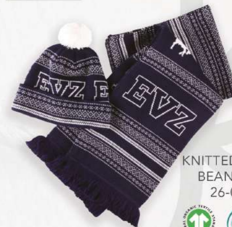
KNITTED SCARF BEANIE SET 26-0504