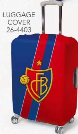
LUGGAGE COVER 26-4403