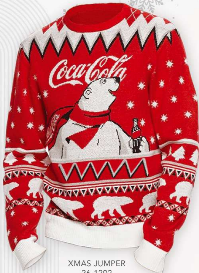
XMAS JUMPER 26-1202