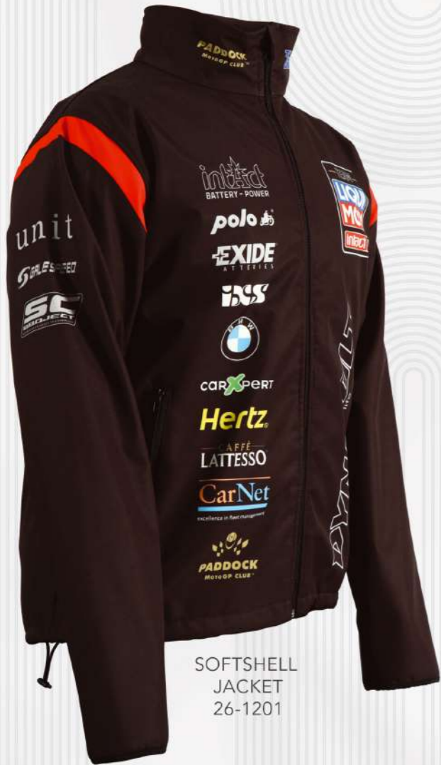
SOFTSHELL JACKET 26-1201