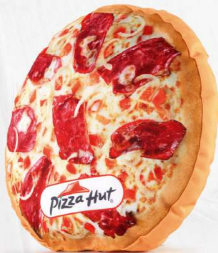
PHOTO PRINT ROUND CUSHION 26-2803