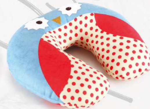
TRAVEL PILLOW 26-2905