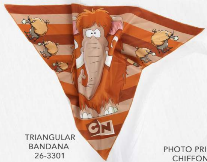
TRIANGULAR BANDANA 26-3301