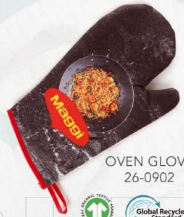
OVEN GLOVE 26-0902