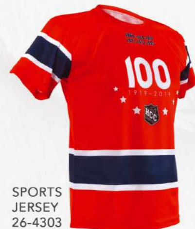
SPORTS JERSEY 26-4303