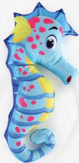
DIE CUT SHAPE SUBLIMATION PRINTED 26-2801