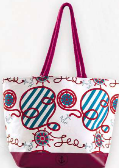
BEACH BAG 26-2204