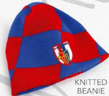
KNITTED BEANIE 26-4503