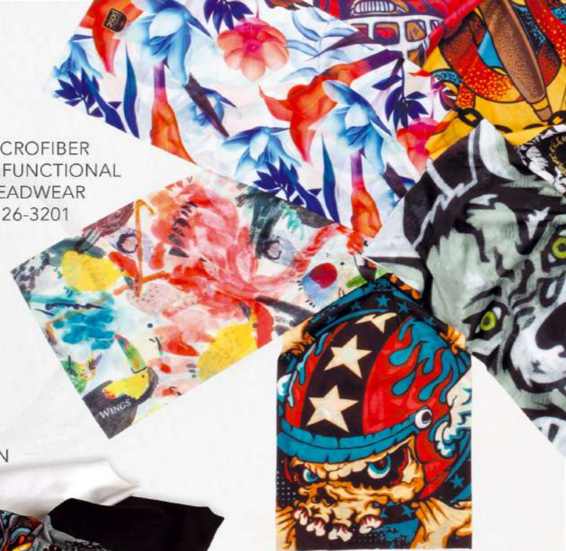
WITH POLAR FLEECE EXTENSION 26-3202