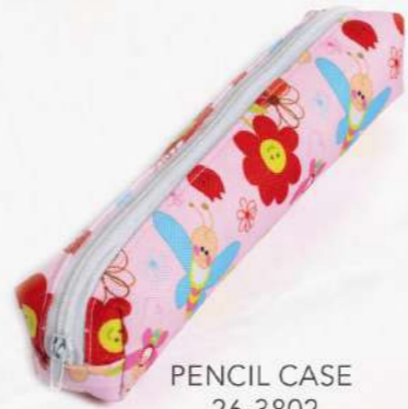
PENCIL CASE 26-3802