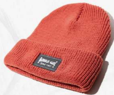
KNITTED BEANIE WITH WOVEN LABEL 26-1802