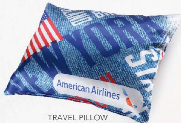
TRAVEL PILLOW 26-2802