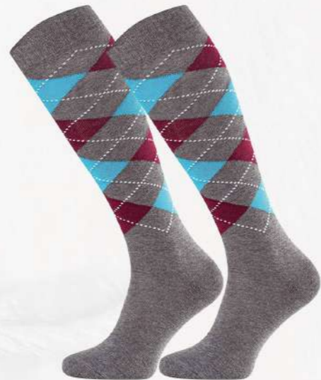
RIDER SOCKS 26-2004