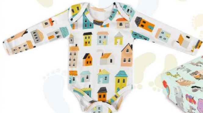
LONG SLEEVE BODY SUIT 26-1403