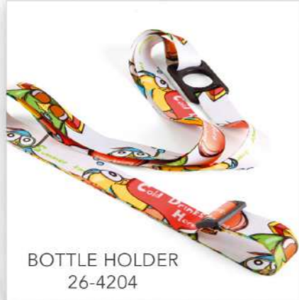
BOTTLE HOLDER 26-4204