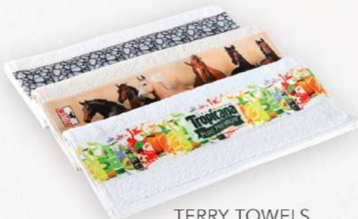
TERRY TOWELS SUBLIMATION PRINT 26-2603