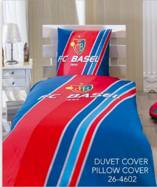
DUVET COVER PILLOW COVER 26-4602