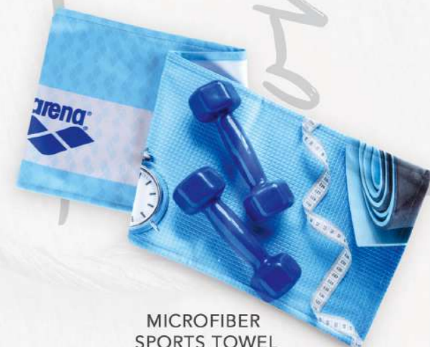
MICROFIBER SPORTS TOWEL 26-2704