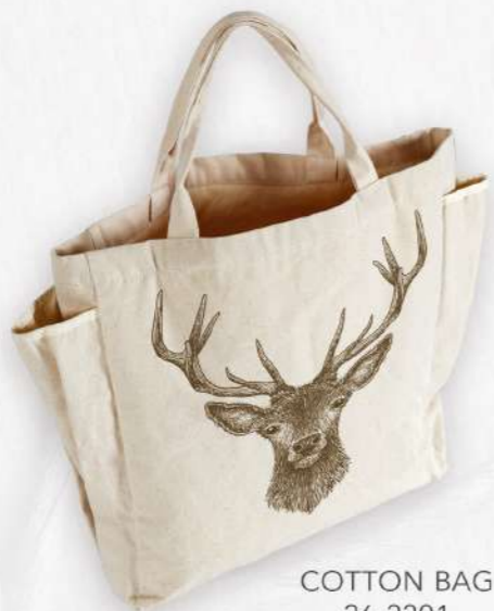
COTTON BAG 26-2201