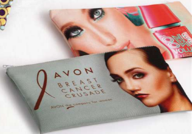
SUBLIMATED COSMETIC CASE 26-3803