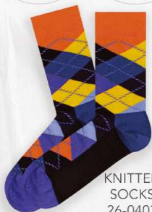
KNITTED SOCKS 26-0403