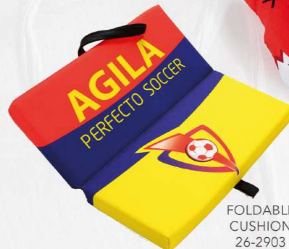
FOLDABLE CUSHION 26-2903