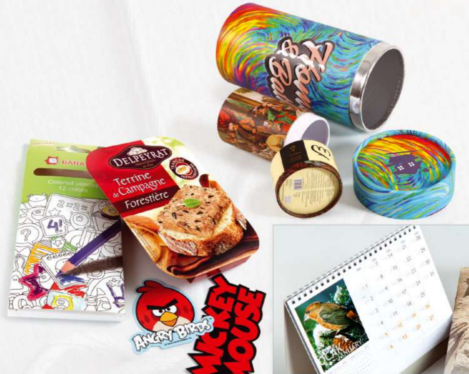
CALENDARS, GIFT WRAPS, GIFT BOXES, FLYERS, PRODUCT BOXES, FOLDERS, NOTEPADS, STICKY NOTES