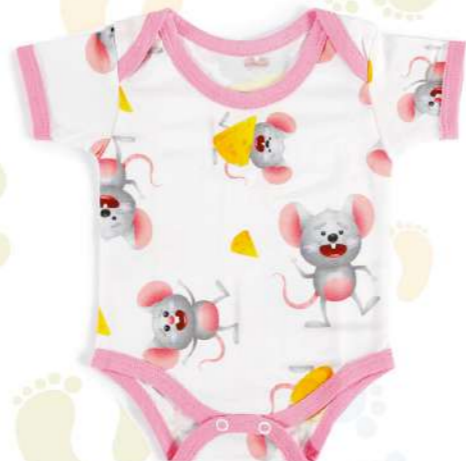
BODY SUIT 26-1405