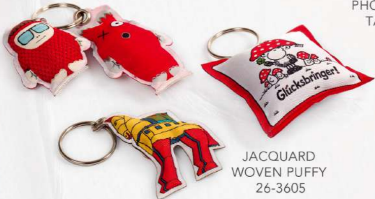
JACQUARD WOVEN PUFFY 26-3605