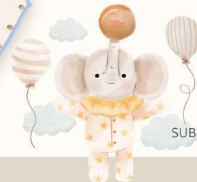
PONCHOS SUBLIMATION PRINT 26-1505