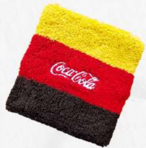
EMBROIDERED TERRY TOWEL WRISTBAND 26-4001