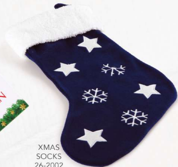
XMAS SOCKS 26-2002