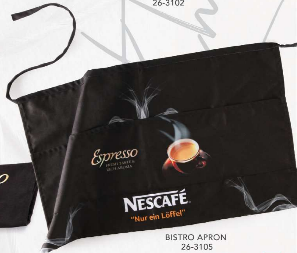
BISTRO APRON 26-3105