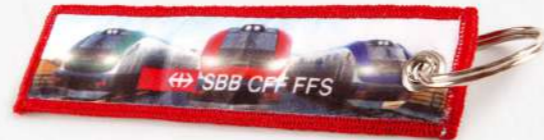
PHOTO PRINTED TAG MODEL 26-3604