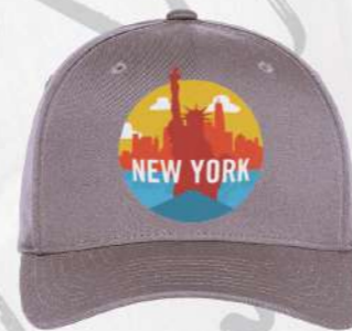
PRINTED CAP 26-1903