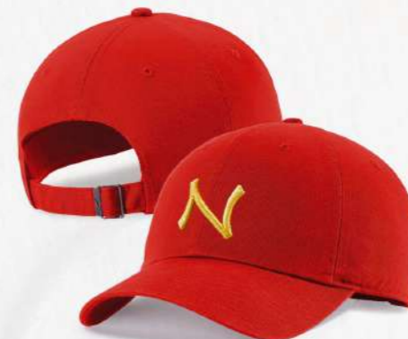
EMBROIDERED CAP 26-1902