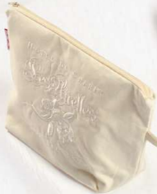
EMBROIDERED COTTON MAKEUP POUCH 26-3804