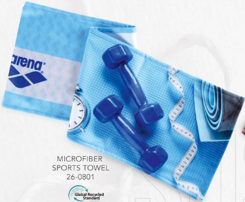
MICROFIBER SPORTS TOWEL 26-0801