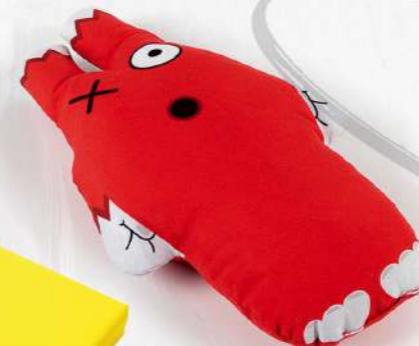
PUPPET PILLOW 26-2904