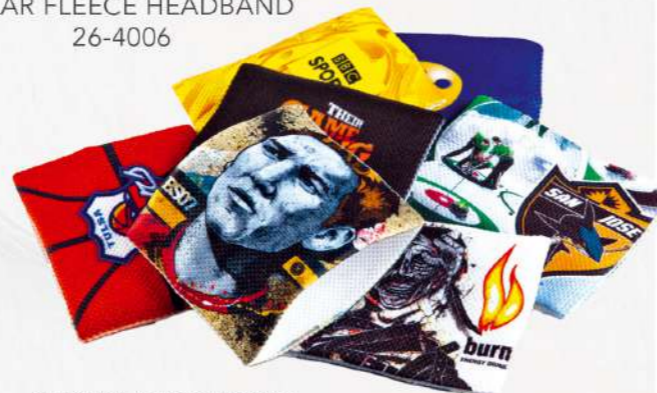
SUBLIMATION PRINT POLYESTER WRISTBAND 26-4009