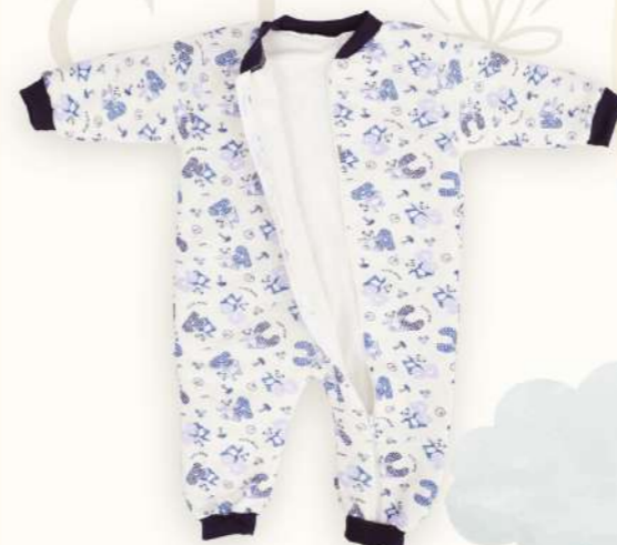
FULL ZIP SLEEPER 26-1501