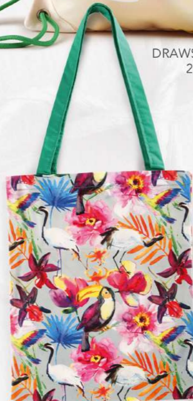
COTTON SHOPPING BAG 26-2303