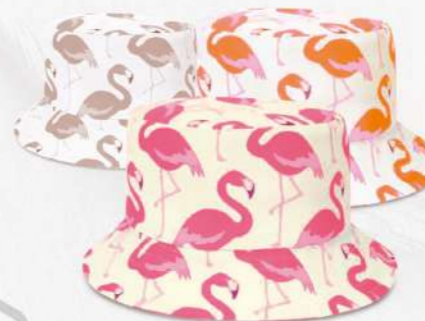
SCREEN PRINT BUCKET HAT 26-1906