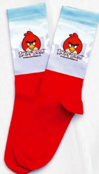
SUBLIMATION PRINTED SOCKS 26-2101