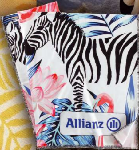
POLAR FLEECE SUBLIMATED BLANKET 26-2402