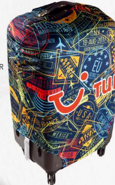
LUGGAGE COVER FULL COLOR DIJITAL PRINT 26-3502