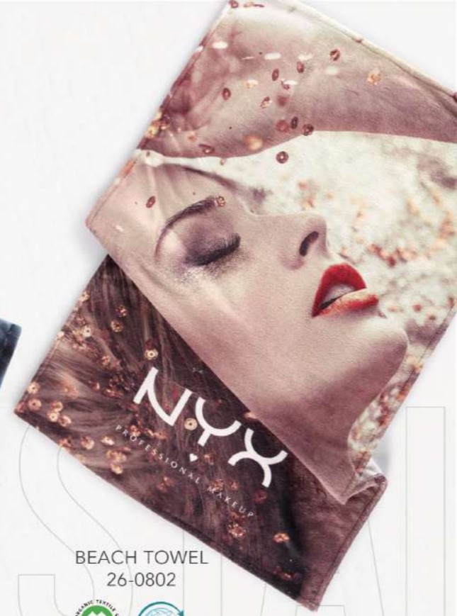
BEACH TOWEL 26-0802