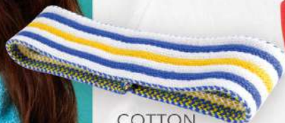
COTTON HEADBAND 26-4004