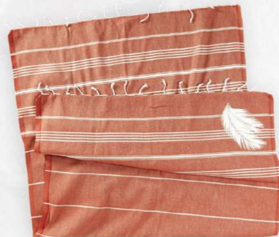
HAMMAM TOWEL 26-2703