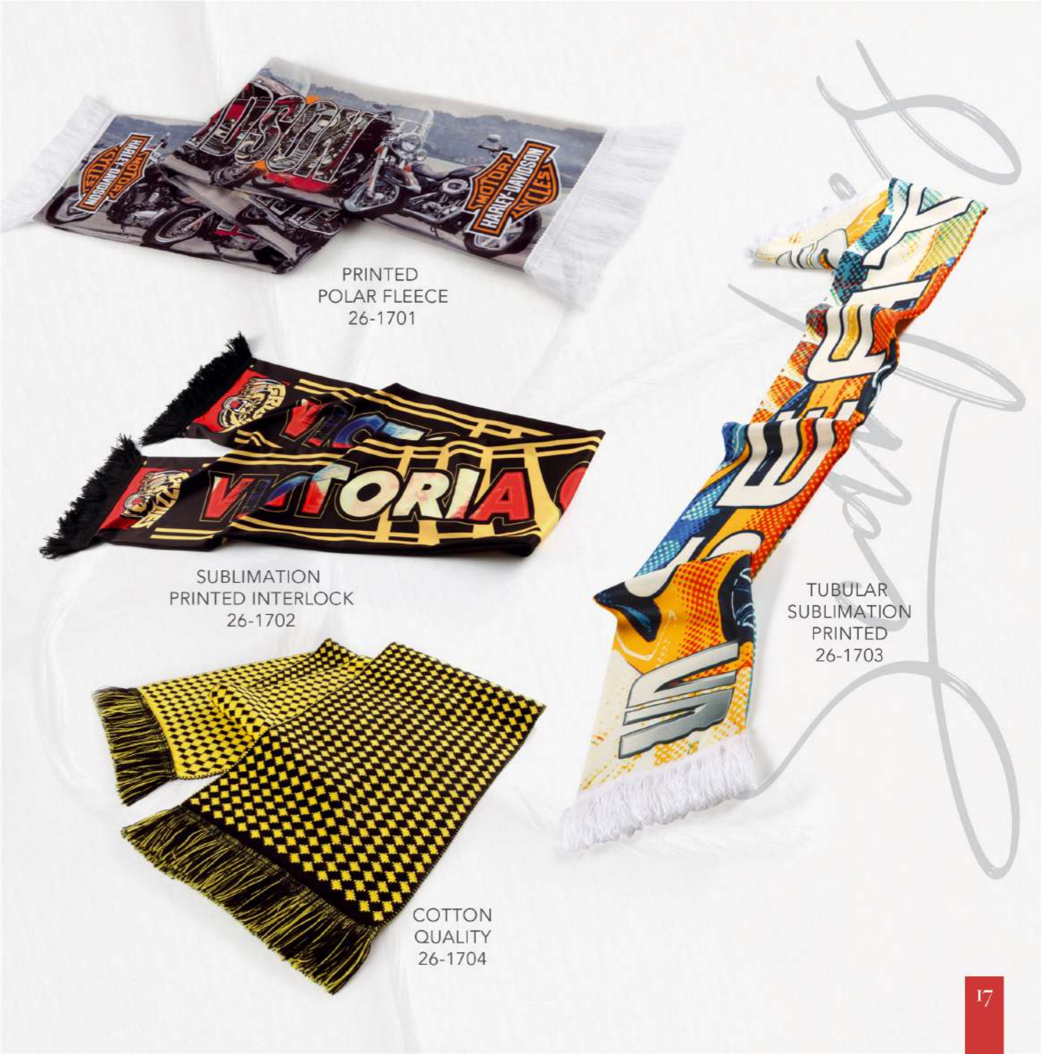
PRINTED POLAR FLEECE 26-1701