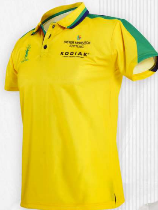
POLO JERSEY 26-1101