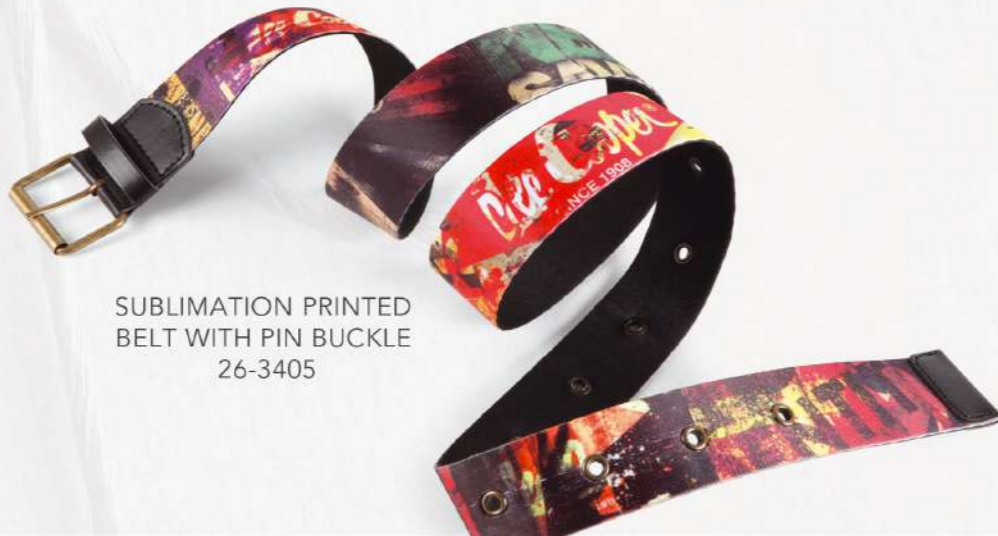
SUBLIMATION PRINTED BELT WITH PIN BUCKLE 26-3405