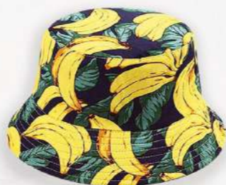
BUCKET HAT 26-0404