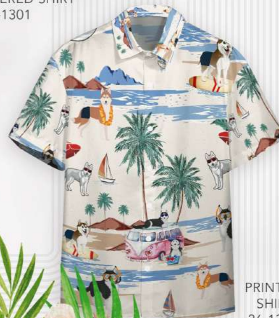
PRINTED SHIRT 26-1302