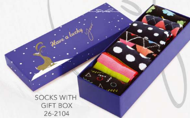
SOCKS WITH GIFT BOX 26-2104