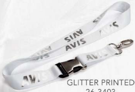
GLITTER PRINTED 26-3403