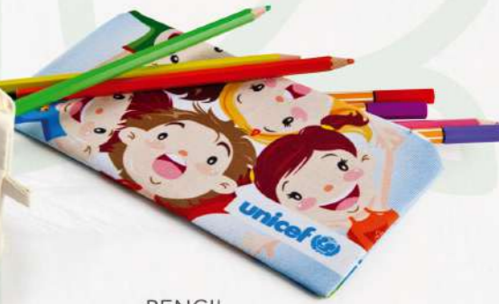
PENCIL CASE 26-0705