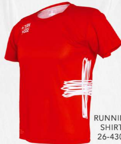
RUNNING SHIRT 26-4302