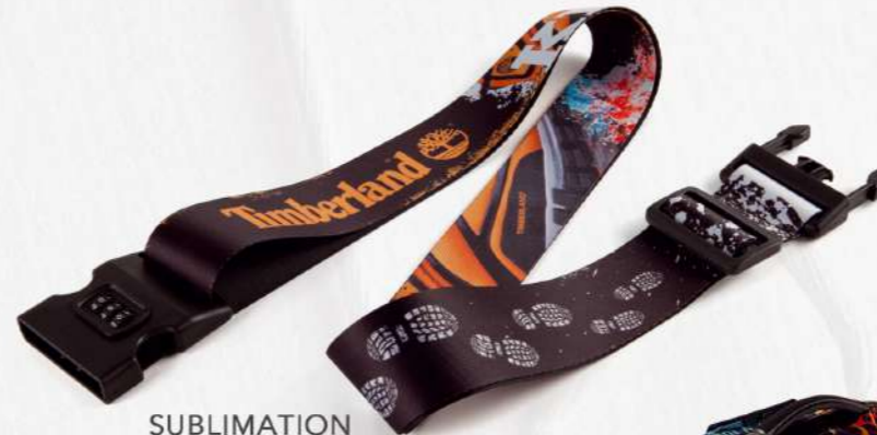
SUBLIMATION PRINT 26-3501