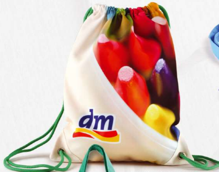
DRAWSTRING BAG 26-2301