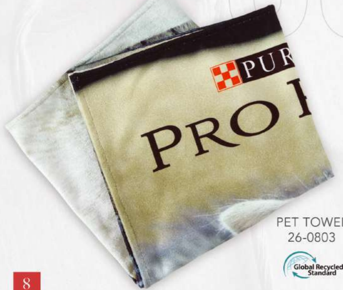
PET TOWEL 26-0803