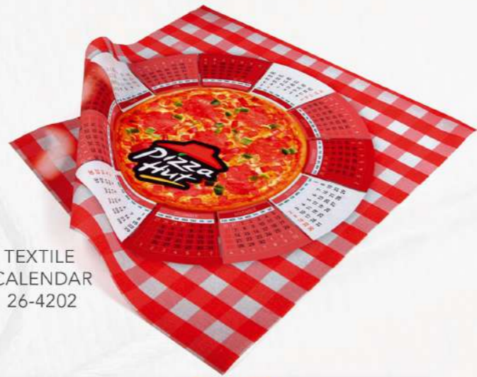
TEXTILE CALENDAR 26-4202