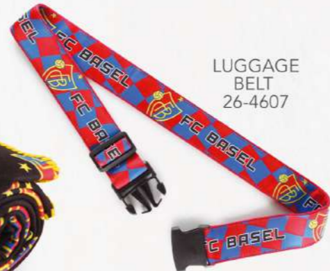
LUGGAGE BELT 26-4607