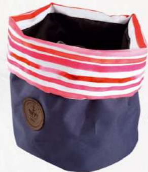
BASKET ORGANIZER 26-3805