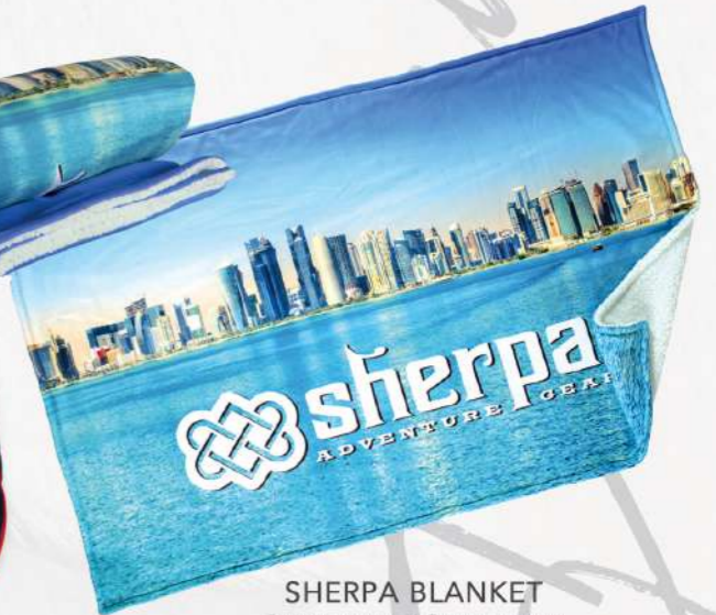
SHERPA BLANKET SUBLIMATION PRINT DOUBLE LAYER 26-2503