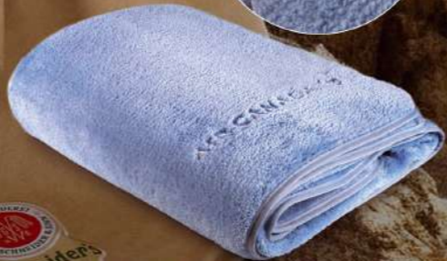
WELLSOFT EMBROIDERED BLANKET 26-2403