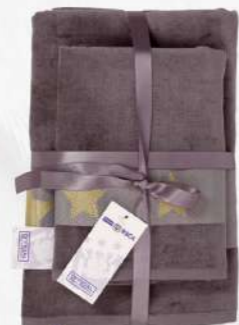
TOWEL SET COTTON 26-2604