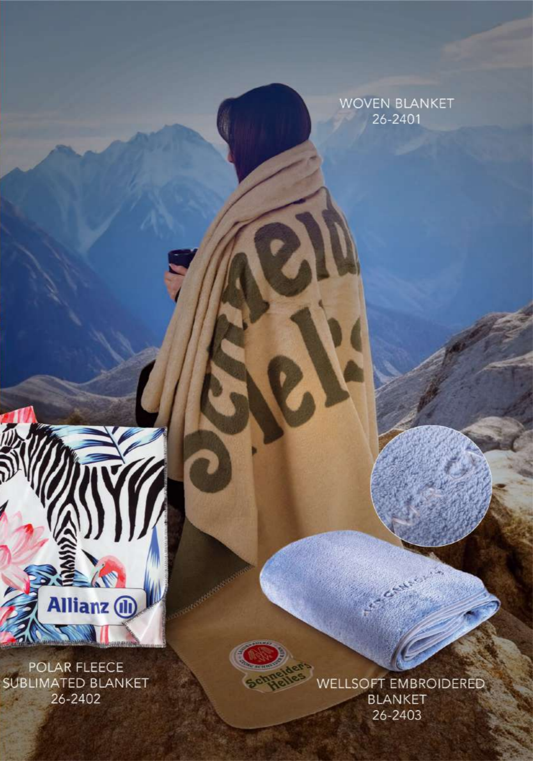
WOVEN BLANKET 26-2401