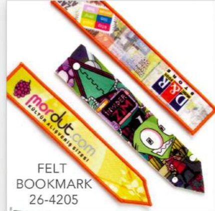
FELT BOOKMARK 26-4205