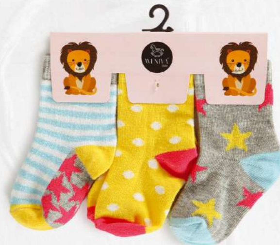
BABY SOCKS 26-2103