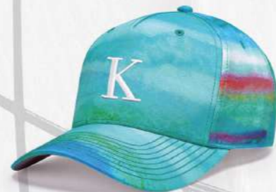
EMBROIDERED CAP 26-1901