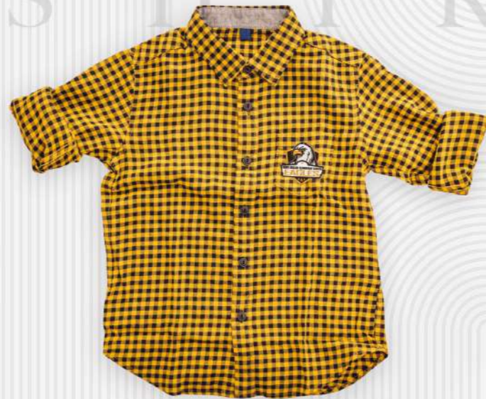
EMBROIDERED SHIRT 26-1301