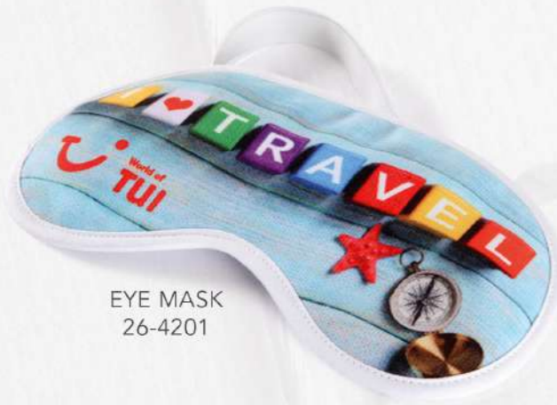
EYE MASK 26-4201