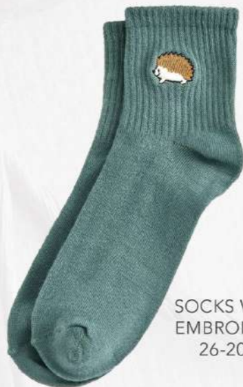
SOCKS WITH EMBROIDERY 26-2003