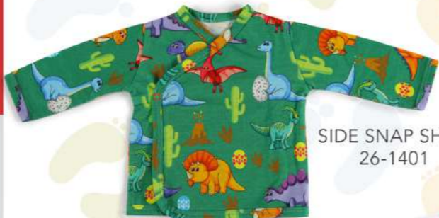
SIDE SNAP SHIRT 26-1401