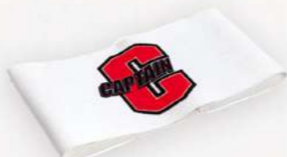
CAPTAIN BAND 26-4005