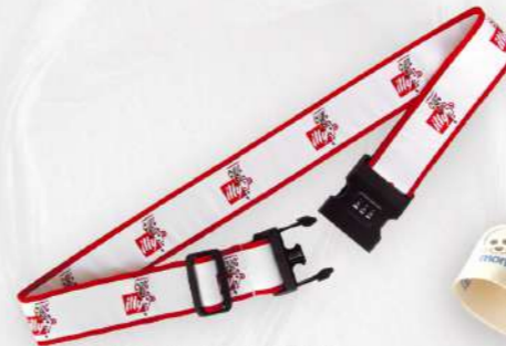
DOUBLE LAYER JACQUARD WOVEN 26-3503