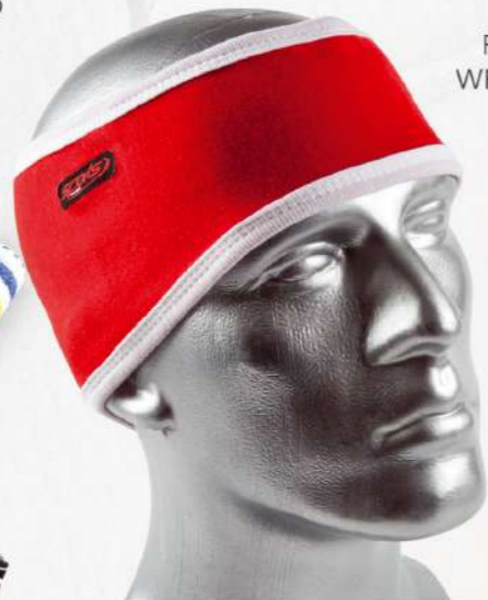
POLAR FLEECE HEADBAND 26-4006