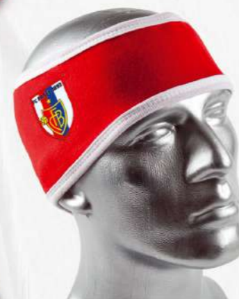
POLAR FLEECE HEADBAND 26-4508